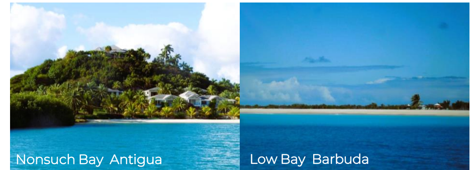
Nonsuch Bay Antigua

Low Bay offers a picturesque coastline that will enjoy all of you if you are looking for a peaceful day, Low Bay Beach is a good choice – whether you decide to lay out and soak in the sun, walk along the soft sand for miles, or jump in the refreshing clear waters of the Caribbean for a swim or snorkel adventure.