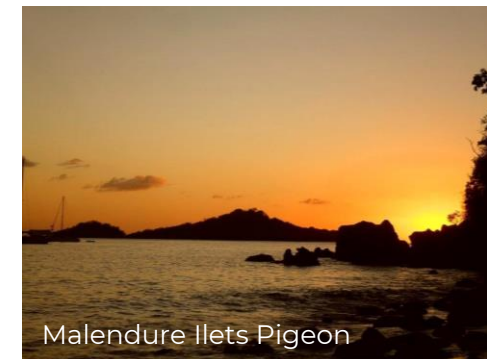
Malendure Îlets Pigeon